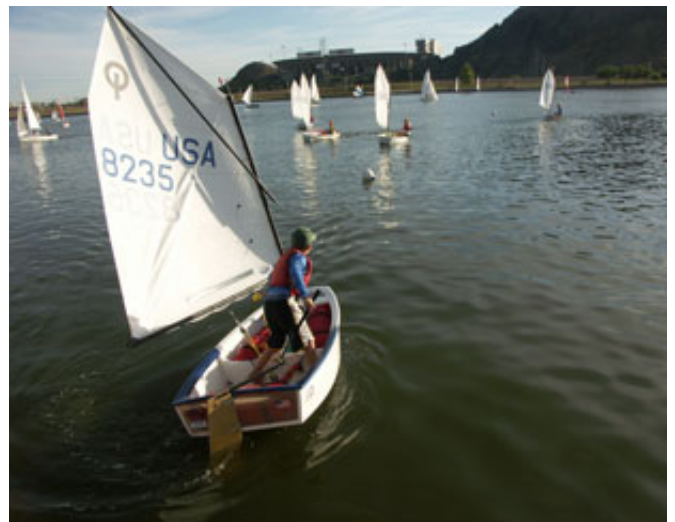
Tempe Town Lake bristles with ASF sails.