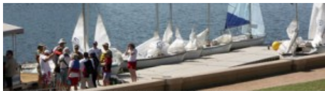
A Start Sailing Right class gathers at the dock to talk over drills.

The Arizona Sailing Foundation is excited to offer their signature learning to sail class, "Start Sailing Right" and their continuing education class, Sailing Skills Development, beginning in February!