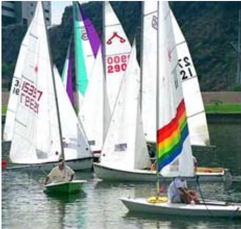
A forest of Portsmouth boats at Tempe Town Lake.

Check with Fleet Captain Joe Motil with any questions you have.