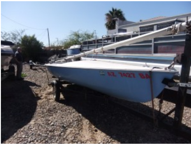
1974 Buccaneer 18