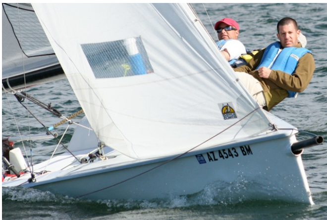
Viper 640 at speed.

It's the new home of the Viper 640 , the light, rapid, carbon-fiber-rich 21-foot, scoop-tailed speed boat.