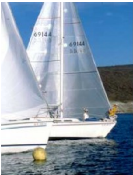
PHRF non-spin boats cross the finish.