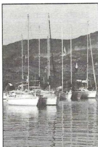
Raft-up at last year's Tall Cactus

Have you sent in your registration for the Tall Cactus regatta? It's the weekend of April 20-21 and it's one of our premier cruising/racing events that will allow you to enjoy cruising without having to tow your boat for hours to a faraway destination. The whole family can sail in this cruising-racing regatta.